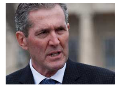
Conservative Premier Brian Pallister betrayed front-line workers with recent layoff announcement.